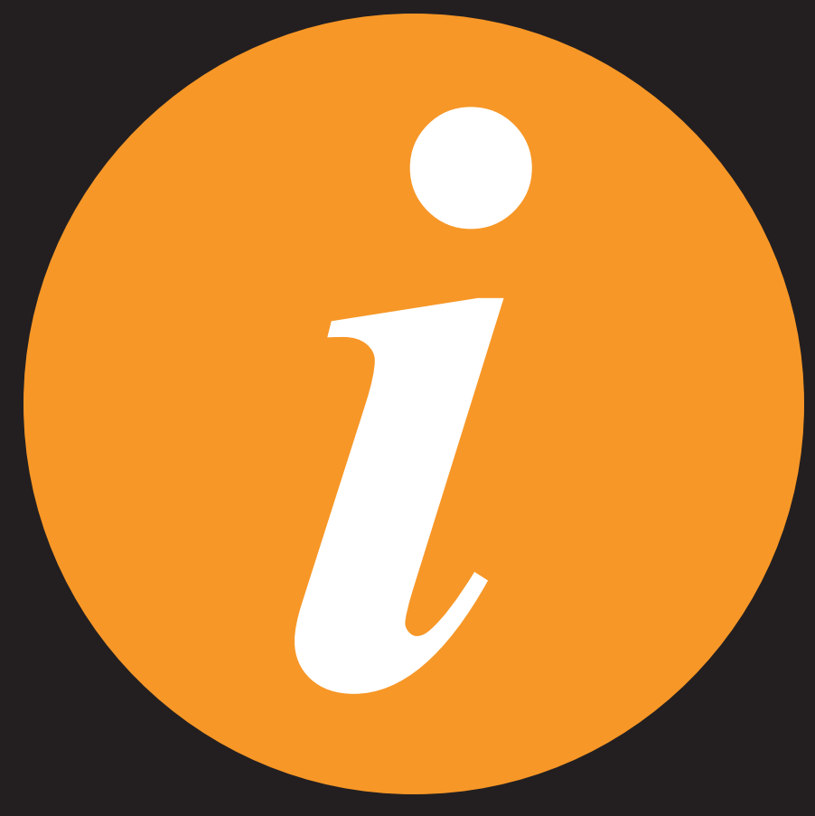
Ashby BART, Berkeley, Sign N262.