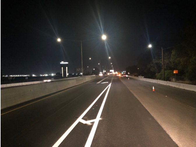
Lane 1 exit buffer near Auto Mall Parkway, northbound I-880

more safely into or out of lane 1. The striping will improve lane performance and lane safety by managing merging traffic in congested areas. View the video, “The Ins and Outs of Double White Lines” .