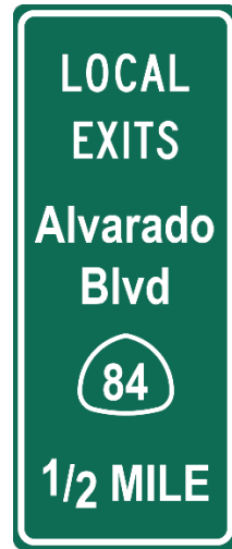
Median barrier signs explain where to exit the far-left lane to reach highway exits.