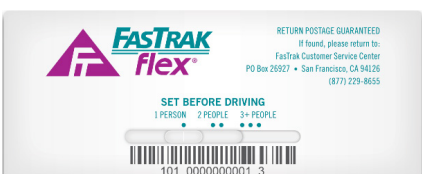
FasTrak Flex® toll tag