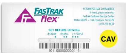
FasTrak® CAV toll tag

On lanes where single-occupant CAV drivers pay half-price tolls, CAVs must use a FasTrak® CAV toll tag to receive the discounted toll. On express lanes where single-occupant CAVs travel toll free, CAVs can use either a FasTrak CAV toll tag or a FasTrak Flex® toll tag.